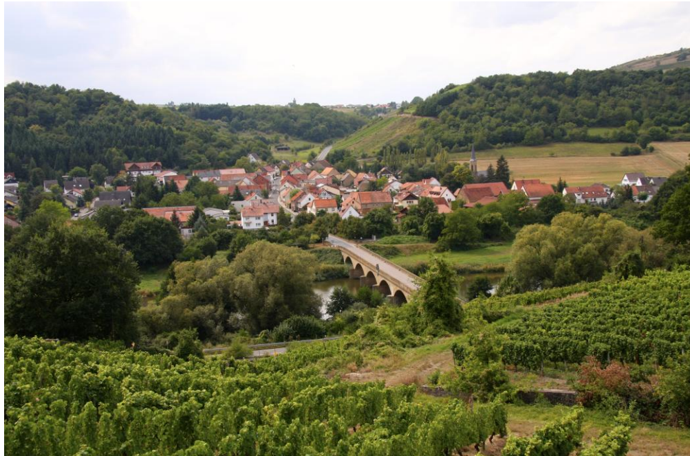
The small village of Oberhausen where Donnhoff is based.