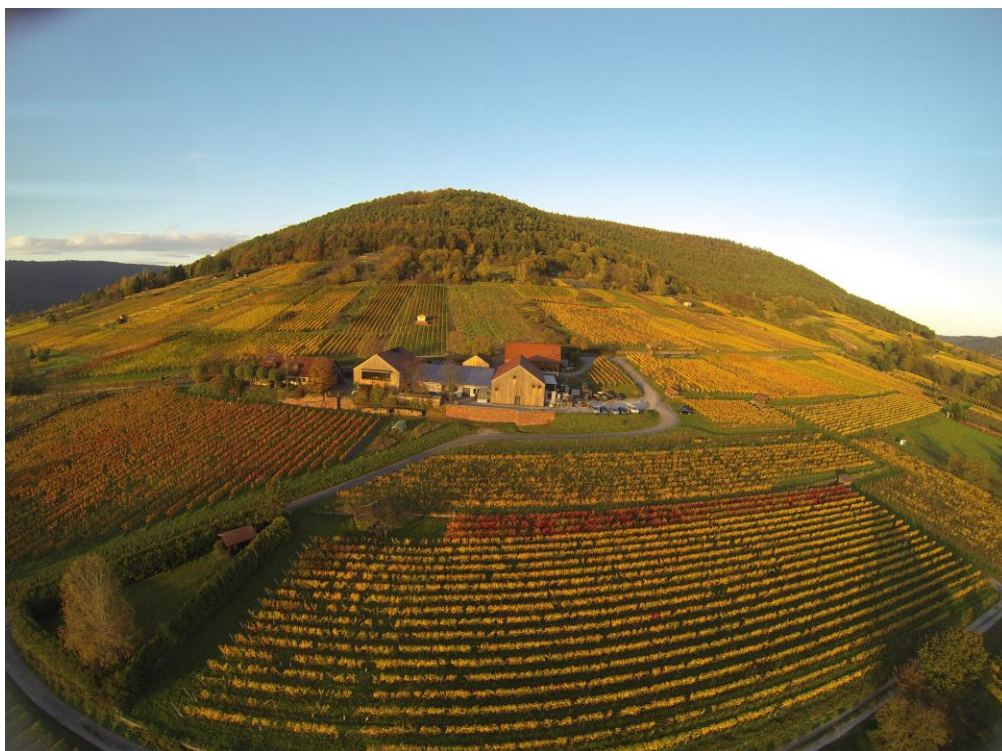
Bird's eye view of the Furst's winery and the Centgrafenberg Grand Cru and Hundsruck Grand Cru (below forested hill).