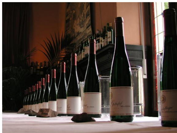
Van Volxem wines.