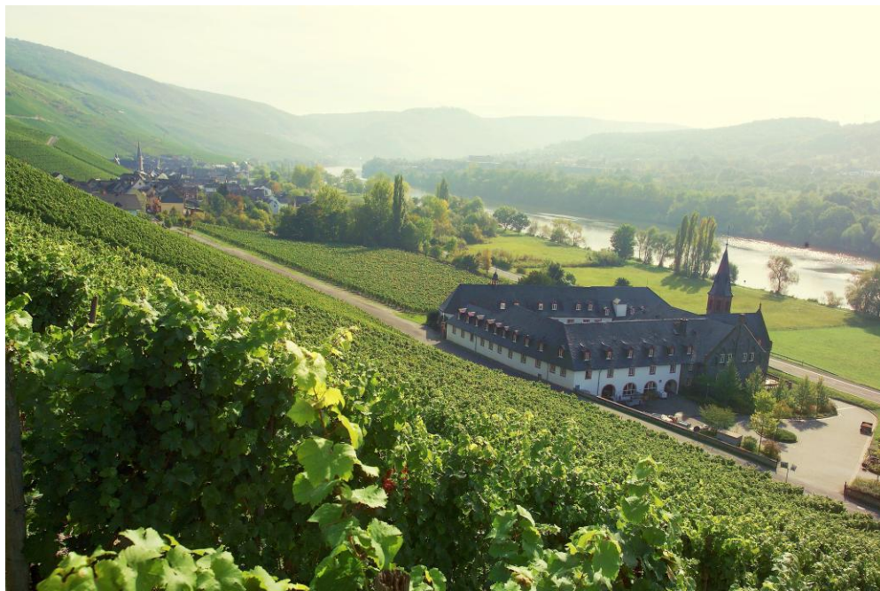
Josephshofer Grand Cru vineyard overlooking the Mosel River